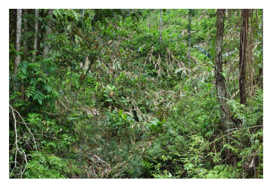
Figure 3. Cardamom recovering from a harsh winter in Bản Khoang Commune, Lào Cai Province, Vietnam.

border in late 2014 and 2015 has caused serious declines in cardamom yields for 2015 and 2016 (Figure 3). Other natural events can also impact harvests, such as when forest fires struck Hoàng Liên National Park in February 2010, and again in 2014. One young Hmong woman had her entire cardamom crop destroyed by the 2014 fires. As she recalled, 'The fire was huge and it took 4-5 days for them to put it out. They had to bring in a helicopter and take water from the lake behind the dam. My cardamom is all gone. The forest there is all gone. Now it's only good to grow maize'. Farmer incomes from cardamom are therefore unstable due to a diverse range of direct and indirect factors.