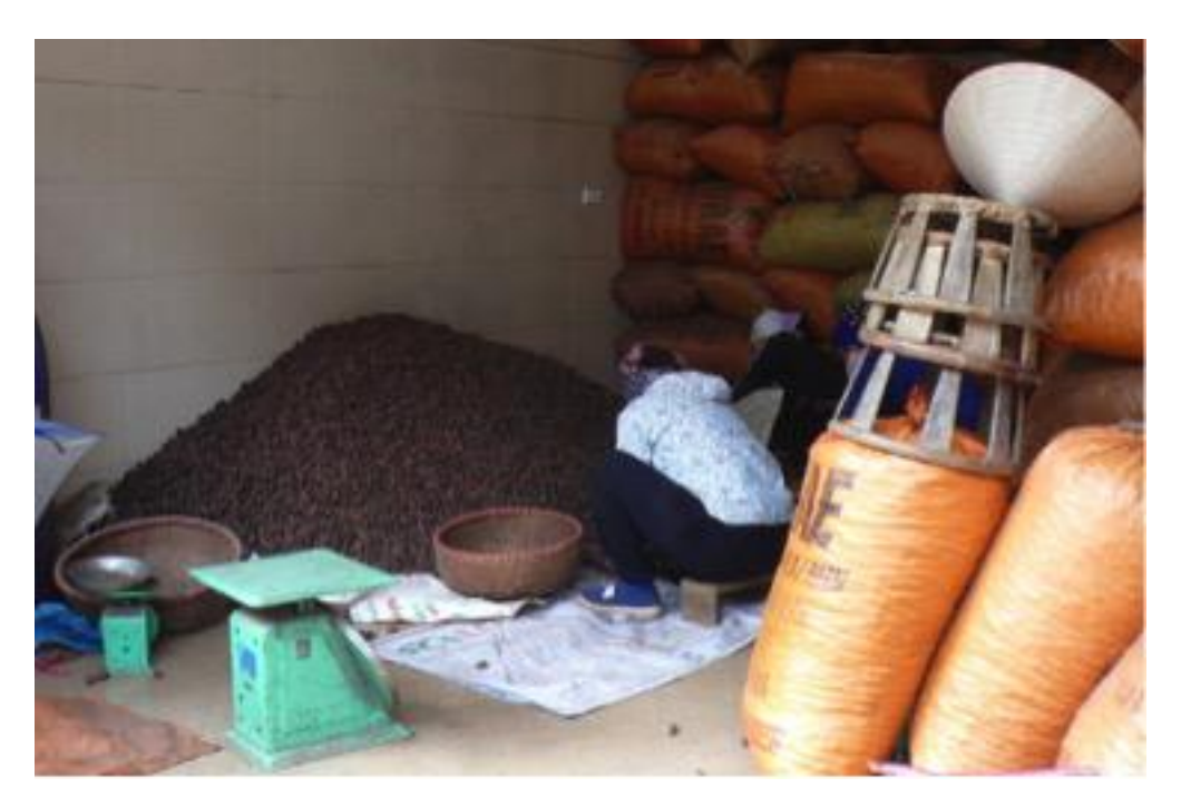
Figure 4. Sorting cardamom for a Kinh wholesaler in Sa Pa town, Lào Cai province.

On the Chinese trade site Alibaba.com, six Vietnamese trading companies offered Vietnamese black cardamom for sale in 2015. Each presented a range of qualities, with the average lowest price being US$5,520 per metric ton, and the highest average price being $47,300 (US$5.52-$47 per kilogram). After the involvement of numerous intermediaries, black cardamom can then retail for a staggering US$105-$918 per kilogram on North American websites for boutique spice stores.<sup>5</sup>