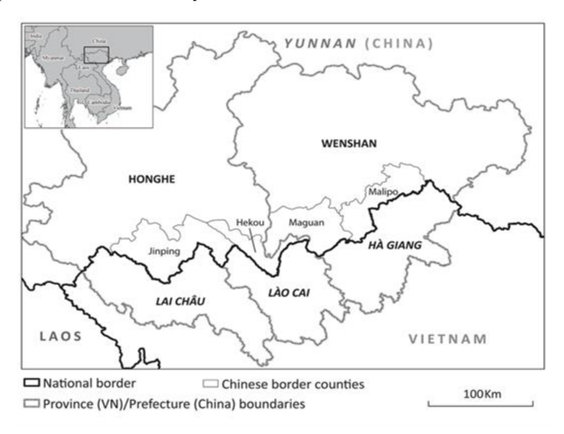
Figure 1. The Sino-Vietnamese borderlands - a transnational space and a key site for the cultivation of cardamom by ethnic minorities.

approximately three years. The focus in Yunnan Province has been on the counties of Jinping and Hekou in Honghe Prefecture, and on Maguan and Malipo in Wenshan Prefecture. In Vietnam, the focus has been on the provinces of Lai Châu, Lào Cai and Hà Giang (Figure 1). Conversational interviews have been completed with over 200 ethnic minority farmers, trade intermediaries, and wholesalers, along with over a dozen semi-structured interviews with state officials including market managers, border control officers, agricultural extension officers, and forest rangers. Interviews with ethnic minorities have been predominantly undertaken with the help of research assistants of that same ethnicity, while those with state officials have been completed with a Vietnamese interpreter or alone.